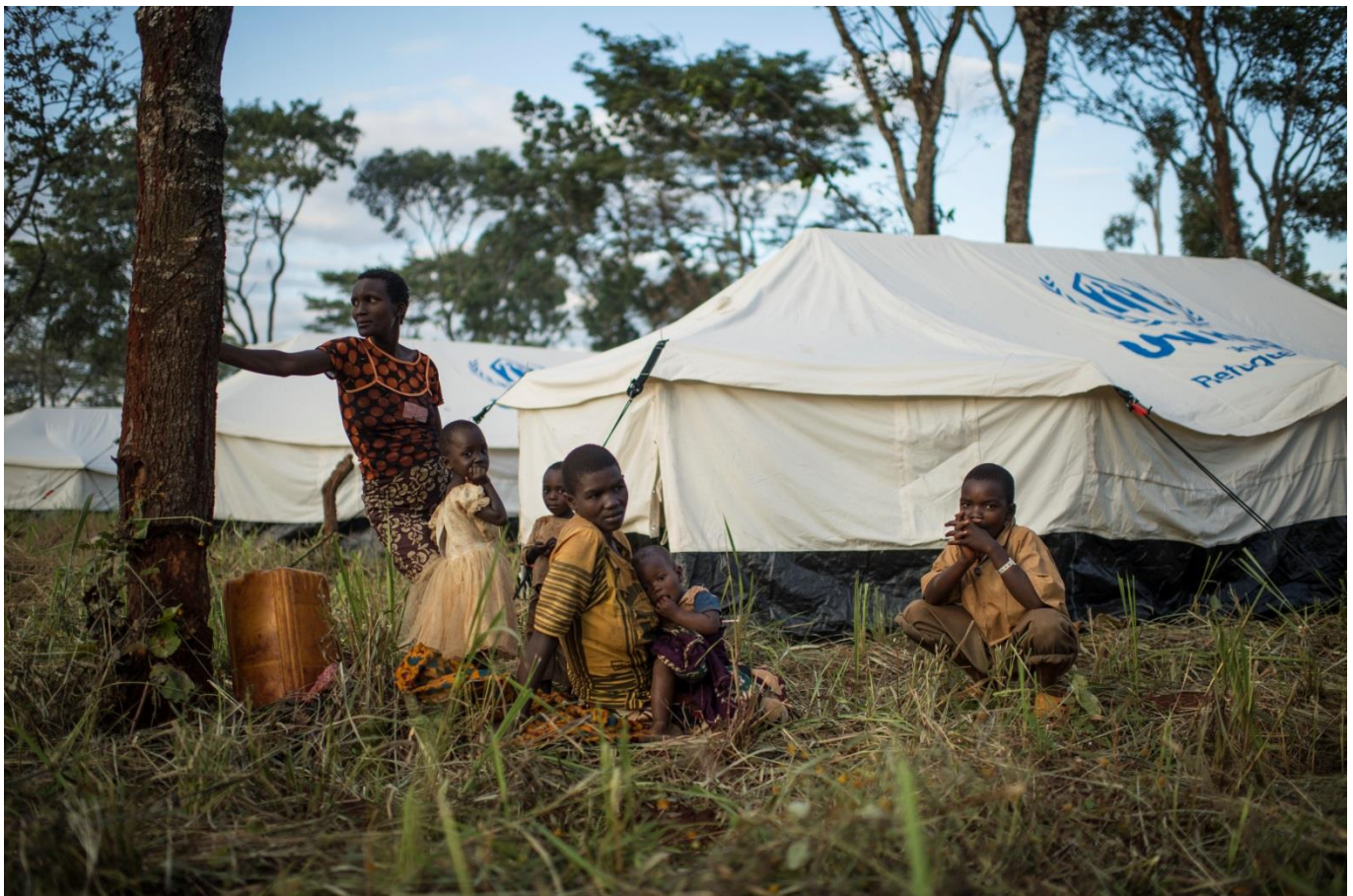
Burundian families in Nyarugusu refugee camp, Tanzania.