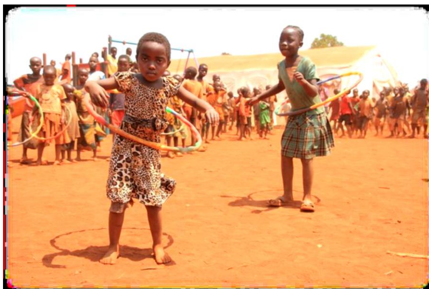
Burundian refugee children playing in one of the Child Friendly Spaces in Nyarugusu camp, Tanzania.