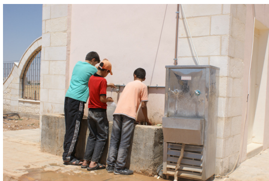
WASH facilities at King Abdullah Park/UNHCR Jordan/2012

Following the spike in the number of displaced Syrians in the Stadium transit facility, UNICEF mobilised 20 portable latrines within 24 hours. These latrines were organised to help meet the urgent needs of the nearly 2,000 people now at the facility.