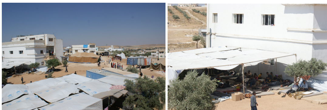
Bashabsheh transit site, Ramtha.

Transit sites are managing to cope with increased numbers as the bailing system continues to work to alleviate pressure. During the reporting period, there was significant movement of people through the transit sites, as all illegal entries were funnelled through the Ramtha facilities. The Stadium in Ramtha was reopened due to congestion in Bashabsheh, with agreement from single males to return to the site. Families were then free to move to the King Abdullah Park container site. In light of the increase in illegal entries, a significant increase has also taken place in the bailing system, with some 3,000 individuals being bailed out to family members or friends.