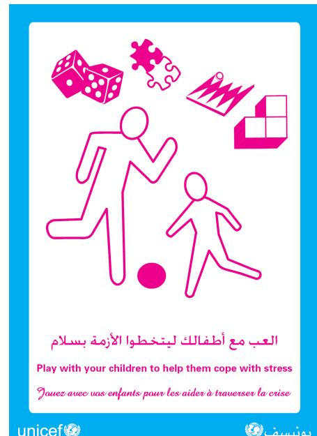
One of UNICEF's child protection posters for transit sites

A UNICEF tent has been released for use as a child friendly space in the King Abdullah Park transit site where children and families will now be accommodated.