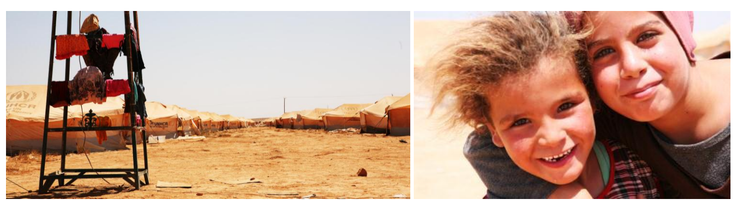
Image of Al Za'atari camp and Syrian girls in the Camp