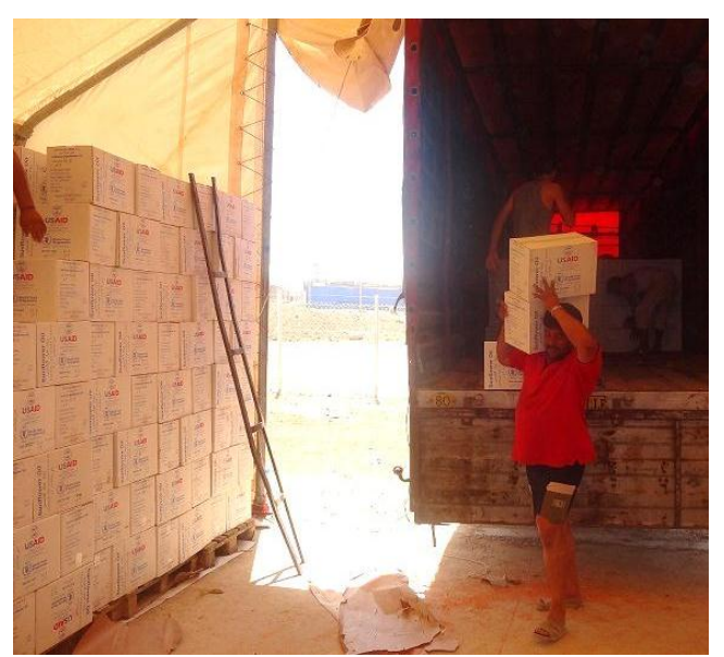
WFP unloading a truck in Erbil, Northern Iraq.

WFP will prepare an implementation/operation plan to define roles and responsibilities of WFP and its partners in the voucher implementation in Iraq based on the final voucher assessment report, conducted by WFP Iraqi Country Office.