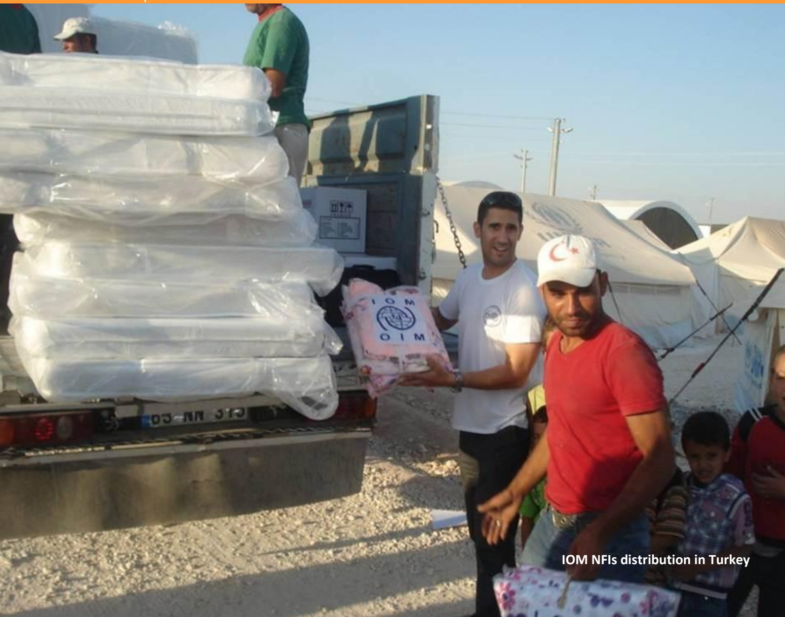
IOM NFIs distribution in Turkey

This report is produced by the International Organization for Migration (IOM) on its humanitarian response for the crisis in Syria. The summary covers events and activities until 25 October. For activities implemented in Syria, please consult the full situation report.