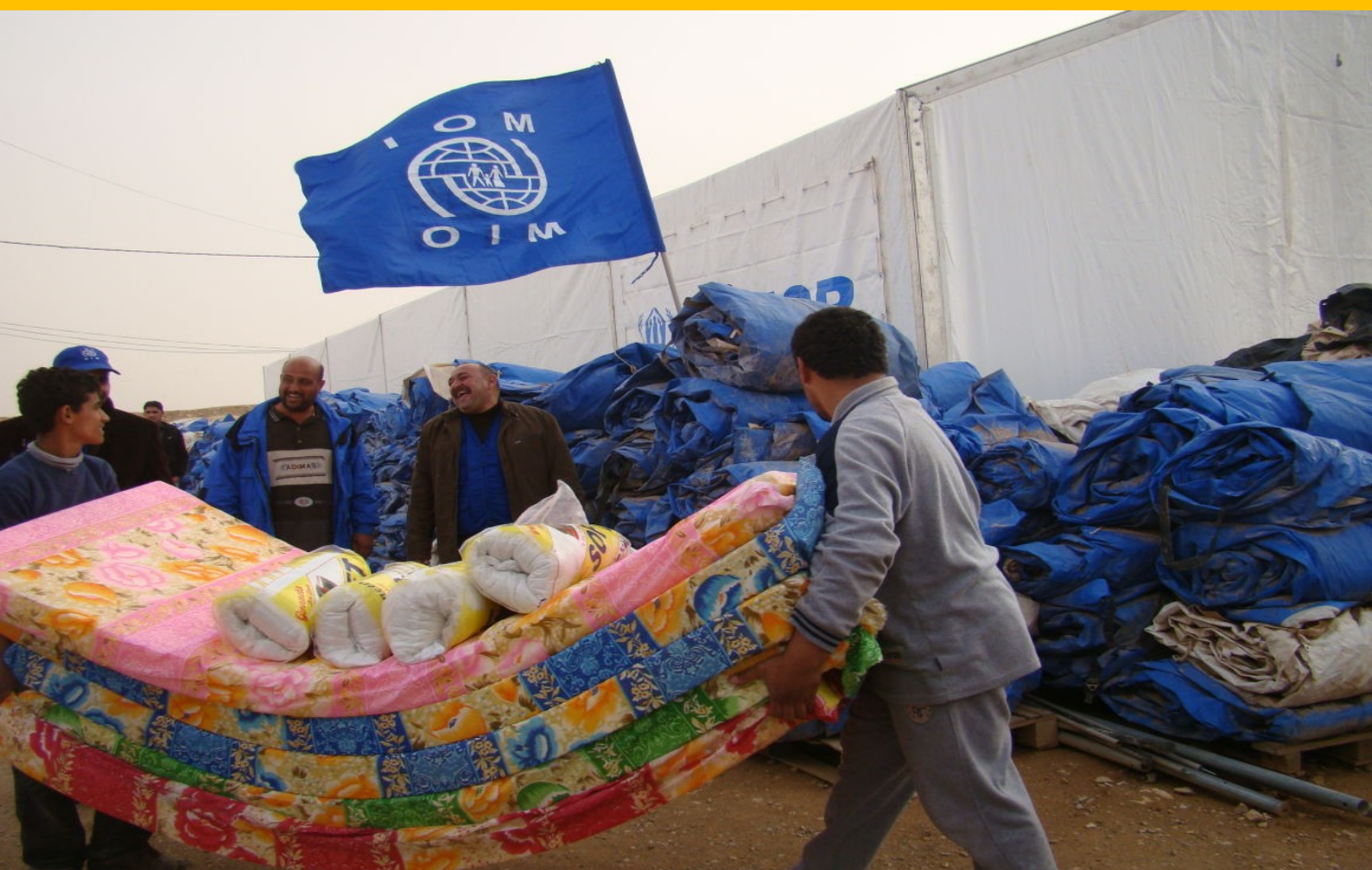
Syrian refugees carry mattresses and blankets distributed in Al Qaim refugee camp in Iraq. Al Qaim Camp, Iraq

For activities implemented in Syria, please consult the full situation report.