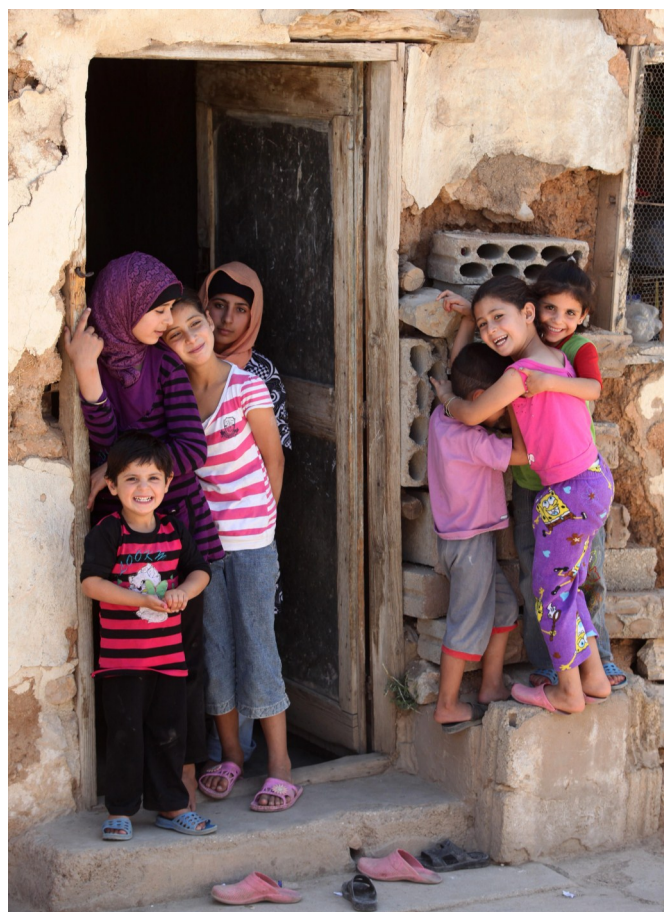
Syrian refugee children in front of a collective shelter in Aarsal, Lebanon.