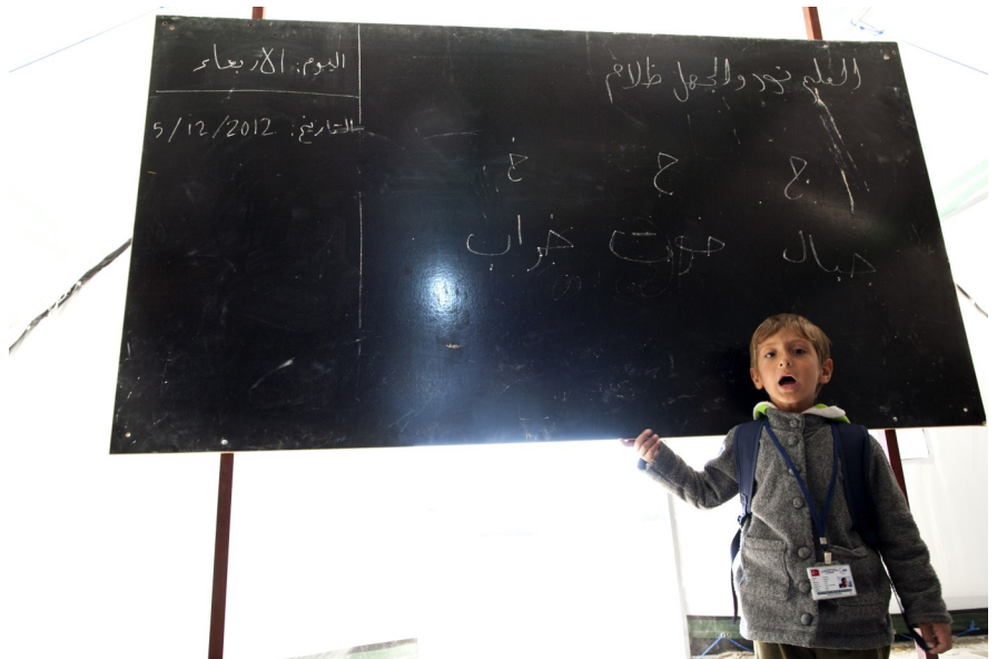
A Syrian refugee boy stands in front of a blackboard while attending class in Adiyaman camp's primary school in Turkey. More than 2,050 Syrian children are attending primary school in the camp, built and run by the Turkish government.

• Egypt - Catholic Relief Services registered 206 Syrians for an education grant.