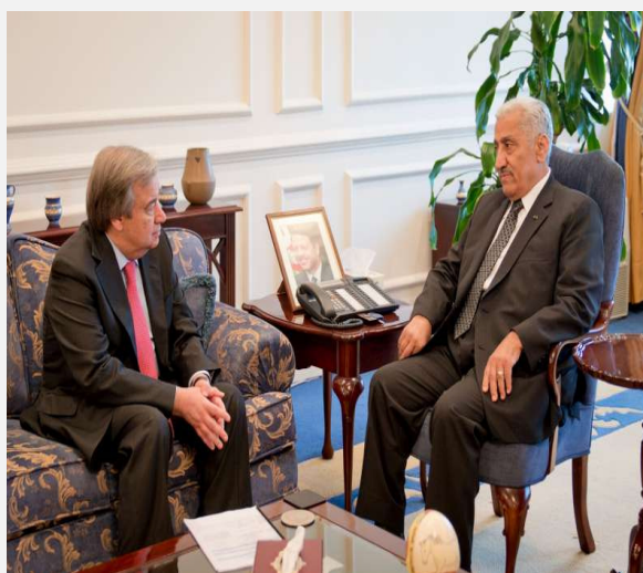
UN Commissioner for Refugees António Guterres (left) meets with Jordan's

His Majesty the King receives the UN High Commissioner for Refugees, Al-Rai