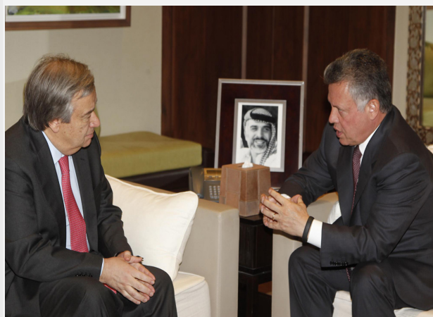
الملك يستقبل المفوض السامي للأمم المتحدة لشؤون اللاجئين

Meeting with the King Abdullah II Bin Al Hussein, Mr. Guterres reiterated UNHCR's commitment to supporting Jordan in managing the refugee crisis as Syrians continue to stream across the border at an average rate of over 1,500 a day.