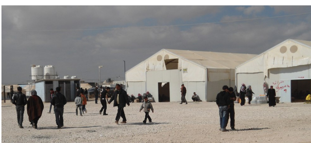
Thousands of Syrian refugees arrive in Jordan every week and are provided with IOM transport assistance to Za'atri camp, Jordan.

Emergency Health Assistance upon arrival in Jordan: During the reporting period, 127 individuals with medical conditions such as upper respiratory infections, skin diseases, gastrointestinal conditions and chronic non-communicable diseases (i.e. hypertension and diabetes), requiring immediate referral or treatment at Za'atri camp health clinics,