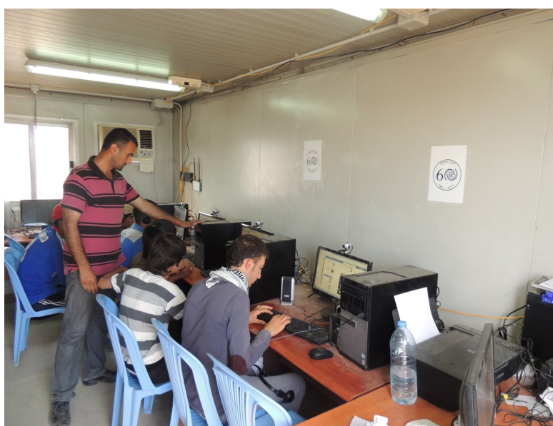
Top: Beneficiaries, that opted to become hair stylists, attend a training course organized by IOM in Dahouk. Above: residents of Domiz camp can go online in the Community Access Technology Center administrated by IOM.