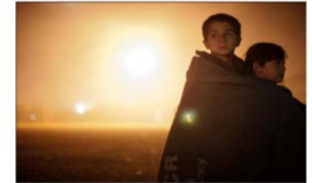
January to June 2013