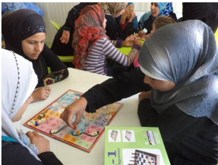
Youth Friendly Space in Al Qa'im Camp 2.

• Jordan - During the week, over 350 women and girls visited the UN Women-supported Oasis in Zaatri camp to participate in a program of recreational, educational and psychosocial activities. UNFPA and IFH-supported women and girls centres in transit sites Cyber City and King Abdullah Park, and Zaatari camp, combined with community-based activities for non-camp refugees, have reached 1,212 women and men.