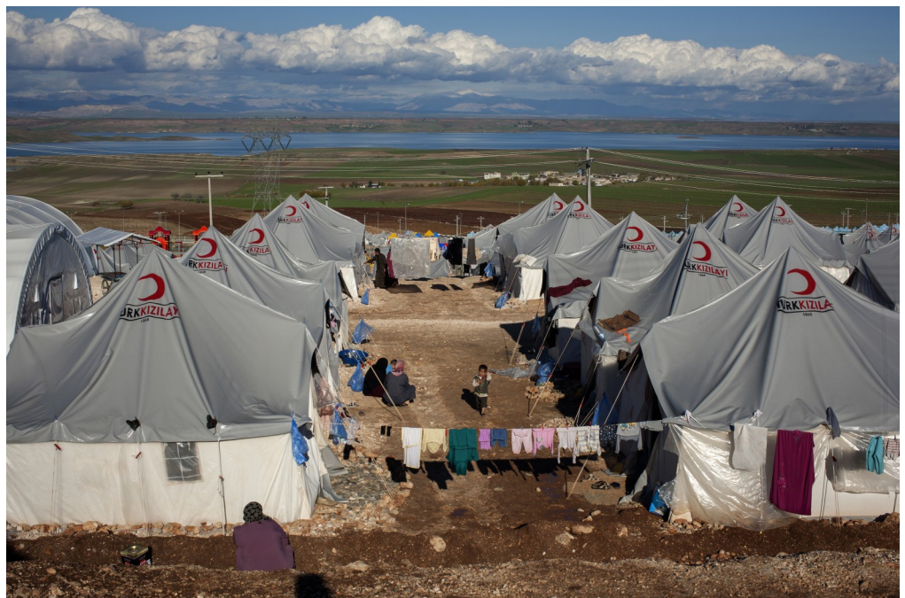
A Syrian child stands amid tents provided by Kızılay, the Turkish Red Crescent Society, for refugees residing in Adiyaman refugee camp. UNHCR provides technical support to the government in assisting the refugees.