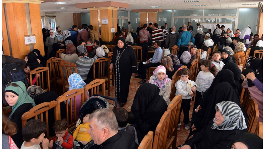
UNHCR Mobile Registration in Alexandria, Egypt.