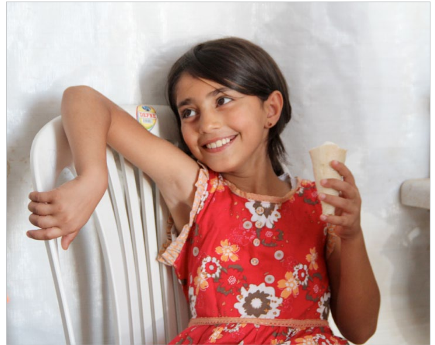
NFI Distributions in Domiz Camp

IOM will continue its tireless efforts in service of these populations; by the end of its PRM-funded distributions, IOM will have reached approximately 25,000 Syrian refugees through this project.