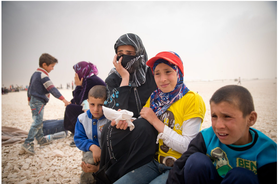
A Syrian mother with three of her children in Za'atri camp, Jordan.