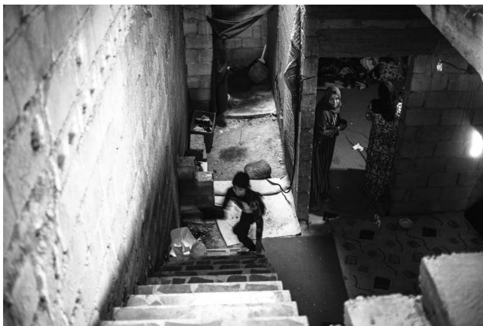
A nine-year-old Syrian refugee runs up the stairs of the partially-constructed building where she and her family are living in Erbil. They fled from Deir ez-Zur, Syria after a shell hit their neighbour's house, killing everyone inside. She said the most frightening thing in Syria was the sound made by the tanks. "It was even more scary than the sound of planes, because I felt like the tanks were coming for me."