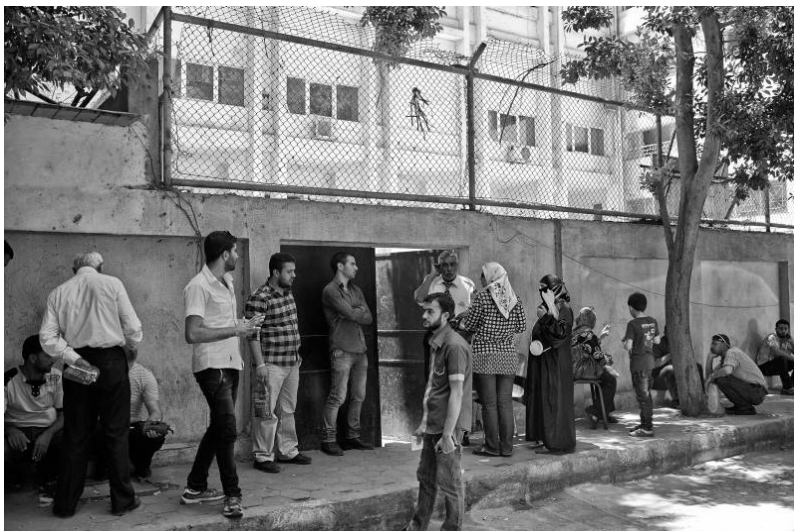
Syrians wait outside the UNHCR office in Cairo to register as refugees.

• Syrians registering with UNHCR are expected to obtain a residency permit from the Government of Egypt on their UNHCR Yellow Asylum-seeker card, or transfer their existing residency to the card. There have been a number of cases recently of the Government not granting residency renewals over failure to adhere to this requirement. UNHCR has been increasing its mass information efforts to ensure Syrians registered with UNHCR are fully aware of the importance of following the proper procedures in regards to their residency permits.