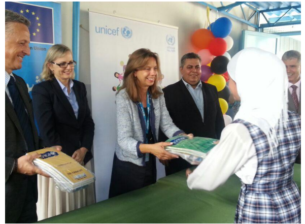
UNICEF's Representative presents a child with a Back to School kit.