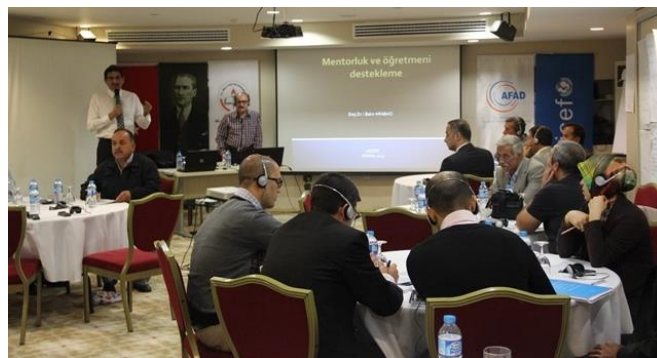
ToT for teacher trainers in Turkey.

Between the 4 and 6 October, the first Training of Trainers (ToT) was undertaken in Adana for 27 participants made up of Ministry of National Education (MoNE) trainers, Syrian teacher trainers, and MoNE camp focal points from Hatay, Adana, Osmaniye, Kahramanmaraş, Malatya and Kilis as a first step for the roll out of training to Syrian teachers in the camps. The aim of the ToT was to train the trainers in the content for the teacher trainings including education in emergencies, child development, the impacts of war on children, basic teaching skills, classroom management, child-centred teaching, and how to set up a camp-based mentoring and support system for teachers. The second ToT will be completed in Sanliurfa between the 25 and 27 October. Following the completion of the ToTs, teacher trainings will be rolled out to approximately 1,410 Syrian teachers who are teaching over 45,000 Syrian students so far in the camps.