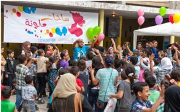
Children take part in activities run by ABAAD at the Beirut Festival.

also an entry point for identification of children in need of further psychosocial assistance and referral. During the first week of activity, the social workers animated activities for 500 children.