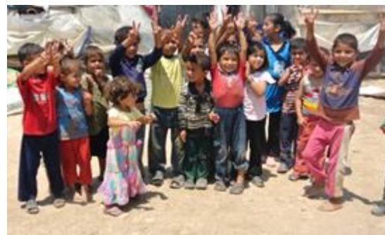
Children play in a tented settlement in Cheikh Ayash.

Children who cannot enroll in formal education are being supported through non-formal education programmes such as the Accelerated Learning Programme or basic non-formal literacy and numeracy programmes. In the past fortnight, 3,367 out-of-school children registered in non-formal programmes, bringing the total number to 31,753.