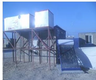
Solar boilers.

UNICEF rehabilitated water and sanitation facilities in five schools in Al-Qaim benefitting 150 Syrian children along with 1,700 Iraqi children and is currently upgrading the efficiency of two water projects feeding the camps. As part of its Winterization Response Plan, UNICEF staff began installing solar boilers for female latrines in Al-Obaidy camp and is coordinating with UNHCR on requisite storm water management infrastructure.