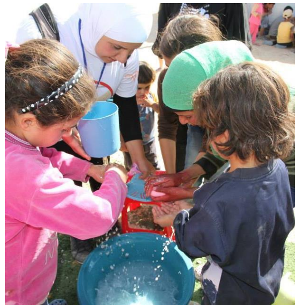
Global Handwashing Day activities

UNICEF/NRC held a graduation ceremony on 10 October at the Youth Centre in Za'atari where 96 students graduated after completing the first vocational training programme.