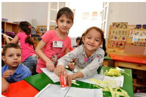
Kindergarten in Greater Cairo

Education UNHCR figures show that the total number of Syrian refugees of school age (5-17 years), as of mid- October 2013, is 36,991 children. Ministry of Education (MoE) enrolment figures have increased, with 20,214 Syrian refugee children enrolled in schools; 16,181 are in public schools and 4,033 in private schools in 25 governorates. It is expected that the numbers will continue to increase as enrolment in schools is permitted through the end of December 2013.