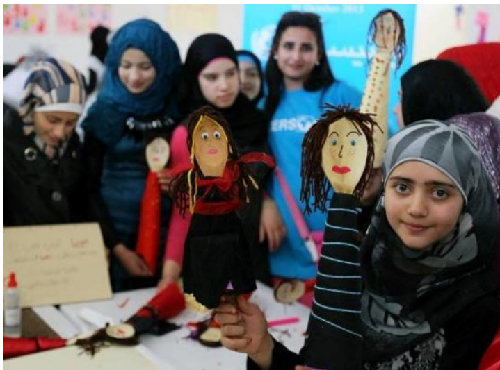
Syrian refugee girls in Lebanon celebrated the second International Day of the Girl Child on 11 October with an event in Jibshit, South Lebanon, that sought to raise awareness of the dangers of child marriage and the importance of education. More than 20 adolescent girls, aged 13 to 18, participated in the event and took part.

Lebanon Country Office is currently involved in three inter-agency collaboration efforts – the Gordon Brown Initiative for Education, the Lebanon Roadmap of Priority Interventions for Stabilization (the Stabilization Framework) and the Regional Response Plan January to December 2014 (RRP6).