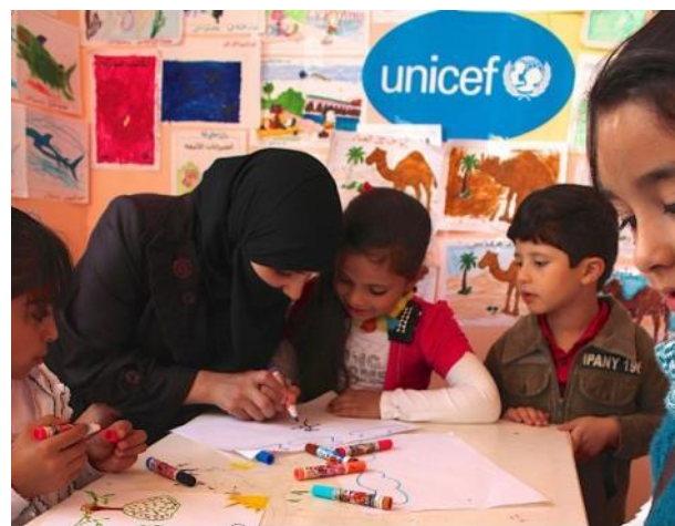
Child friendly space in Bourj al Ara, Alexandria

A team of lawyers and social workers has been actively providing legal aid and support to more than 180 children in detention in connection with irregular migration to Europe. This includes legal representation, regular monitoring visits, emergency medical aid and coordinating responses with families and services providers.