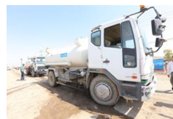
Water trucking UNICEF-Iraq/2013

UNICEF, in coordination with the Erbil Surrounding Water Directorate (ESWD), is trucking in 400,000 litres of safe water daily. In partnership with the Norwegian Refugee Council (NRC), UNICEF has installed water storage tanks and 290 latrines. A second round of family hygiene kits and washing basins were distributed to 2,336 families. UNICEF has contracted a private company to collect garbage around the camp daily and is providing access to safe water and sanitation services for children at their learning environments and CFSs. In partnership with ESWD, UNICEF has completed three boreholes and the layout for phase 1 of the permanent camp.