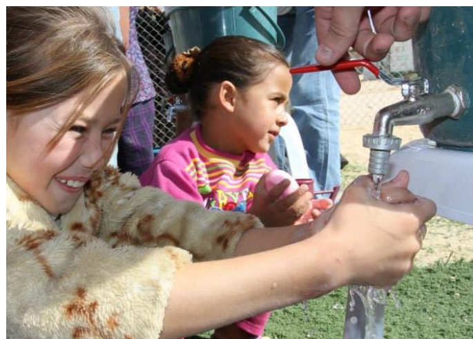
Global Handwashing Day activities

WASH UNICEF and partners celebrated "Global Handwashing Day" through various events in camps and host communities. JEN organized an event at Irbid's Al Bushra School for girls, involving 450 students (including 100 Syrian students), teachers, parents and representatives from Irbid Education Directorate in events such as stage plays on WASH, drawing competitions, games and songs. In Za'atari, King Abdullah Park and Cyber City camps, some 3,390 children participated in various Global Handwashing Day activities organized by UNICEF/ACTED/JEN/Oxfam. These activities were carried out in Save the Children Child- and Youth-Friendly Spaces, International Relief and Development (IRD) tents, and ACTED tents. Activities included games, drawings, kites, and a demonstration of hand washing.