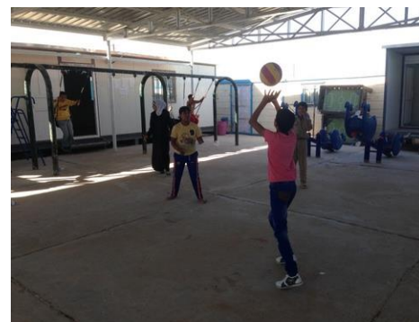
Children in a CFS in western Iraq.