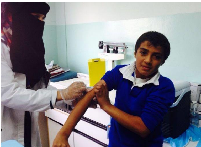
A boy in Mafraq receives MMR

Prior to the NIC, UNICEF delivered a total of 1,500 vaccination kits and 3 million flyers, posters and banners for distribution through schools, mosques and public health facilities and conducted a massive awareness/social mobilization and media campaign.