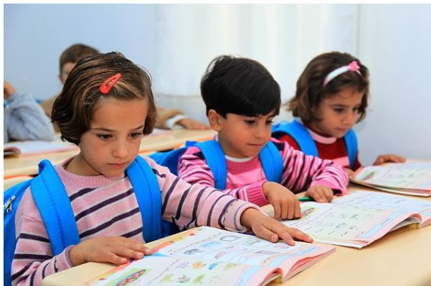
Islahiye, 2013.

classroom management techniques and psychosocial support for teachers and students. Through the training completed to date and with on-going support to Syrian teachers, 6,281 children enrolled in schools in Maras, Osmaniye and Adana will benefit from these improved skills. Syrian teachers attending training in camps also receive small cash incentives as all teachers in camps are volunteers and cannot currently be provided with a regular salary. This also ensures that the work of teachers is recognized and valued.