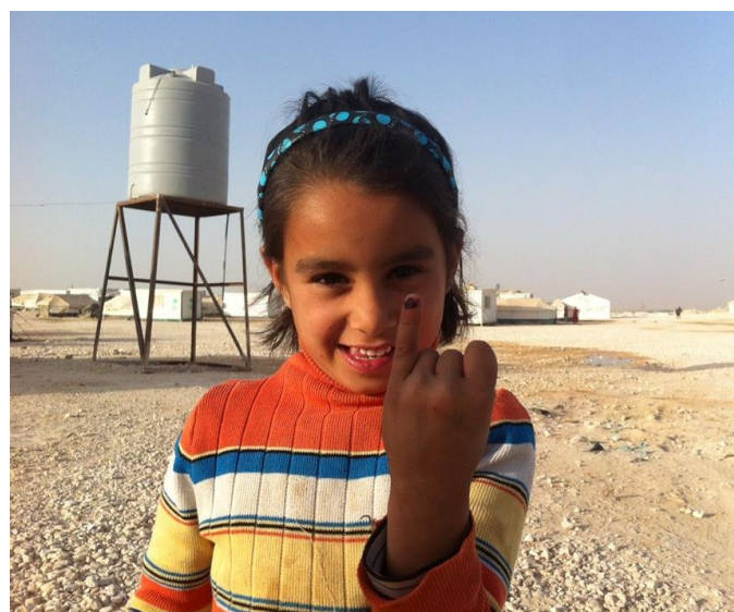
Pinky mark to show receipt of polio vaccine