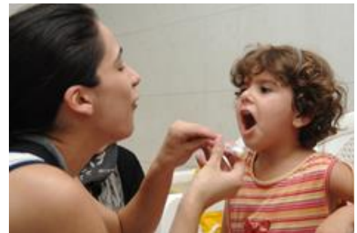
A child receives the oral polio vaccine.

Health The first of two nationwide polio campaigns began this week, with UNICEF working with the Ministry of Public Health (MOPH) and Beyond Association to vaccinate all children under five in informal tented settlements, as well as providing mandatory polio immunization to all children under five at the three border crossings from Syria to Lebanon. Since the introduction of mandatory polio immunization at the border, 3,000 children have been immunized by UNICEF, MOPH and Beyond. UNICEF is providing all of the vaccine doses required for all agencies for the campaign, with 1.5 million doses procured, as well as 500 vaccine carriers. These supplement the 280,000 doses that UNICEF already had in country.