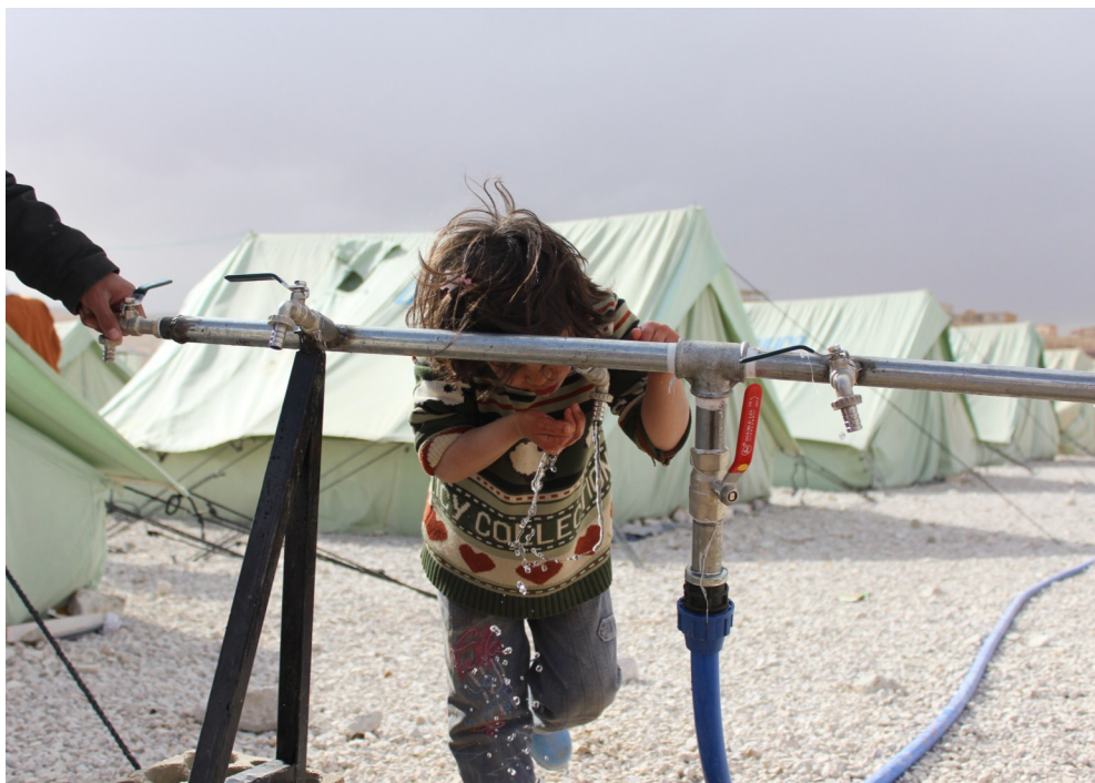
A child accessing a water point in the temporary shelter site, Aarsal.

35,000 residents of Aarsal + 20,000 registered refugees* + 20,000 refugees registered with the local municipality = 75,000 total population in Aarsal