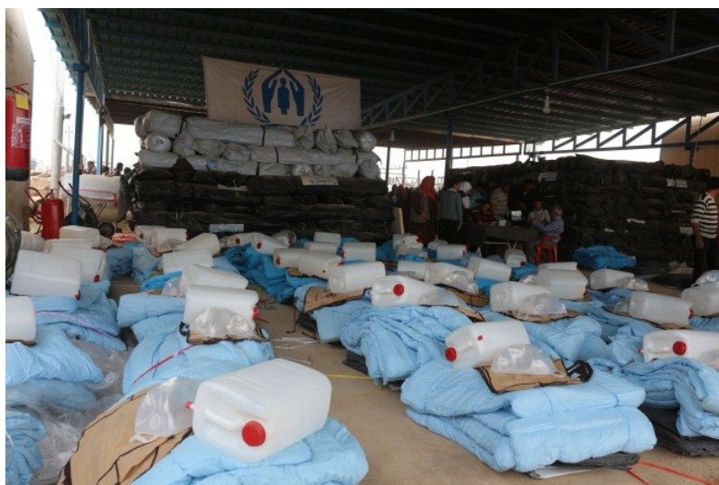
Distribution of Winterization items in Domiz Camp, Dohuk in the Kurdistan Region of Iraq.

The regional response for refugees fleeing Syria is the coordinated effort of 126 participating organizations, including 84 appealing: