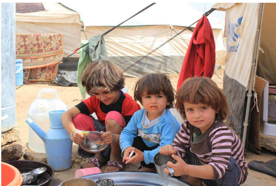
Young Syrian refugees in Kawergosk camp, Kurdistan Region.