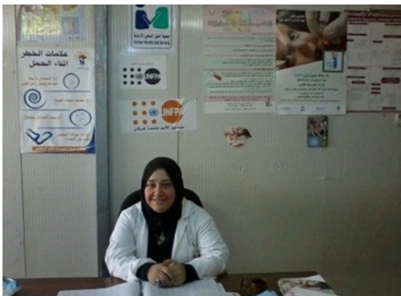
Doctor providing reproductive health services in the Cyber City refugee settlement, Jordan.