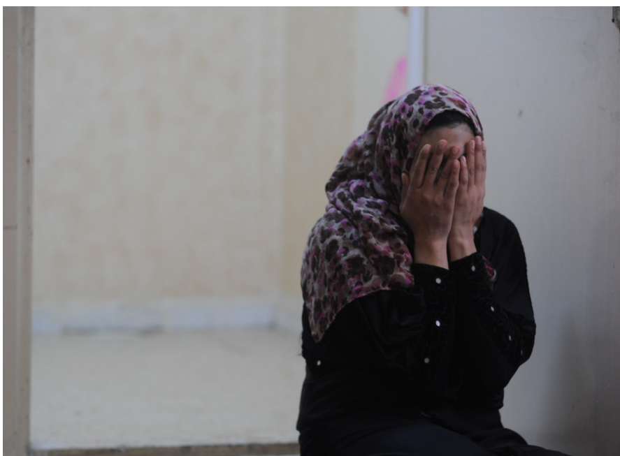
Palestine refugee woman from Syria registered with UNRWA in Jordan.