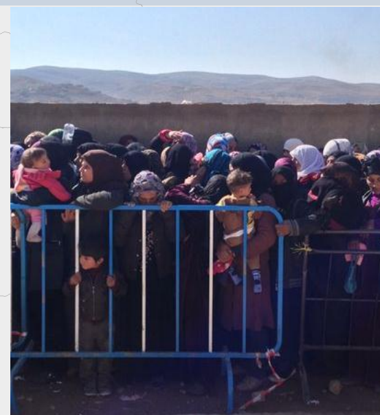
New arrivals in Arsal queue to be pre-registered and receive assistance