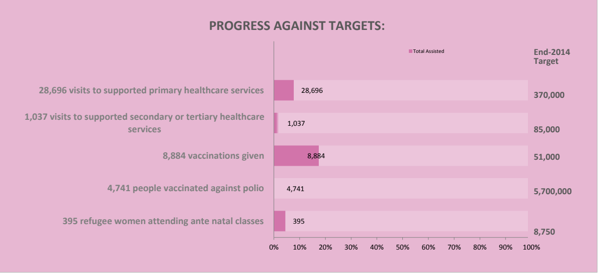
Targets based on expected population of 400,000 Syrian refugees in Iraq by end-2014. There are currently 217,144 refugees.

Leading Agencies: WHO Participating Agenecies: WHO, UNHCR, UNICEF, UNFPA, PU-AMI, IMC, UPP