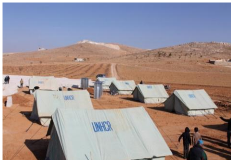
Formal Settlements set up in Aarsal, Lebanon - UNHCR

*One partner may be working in multiple locations