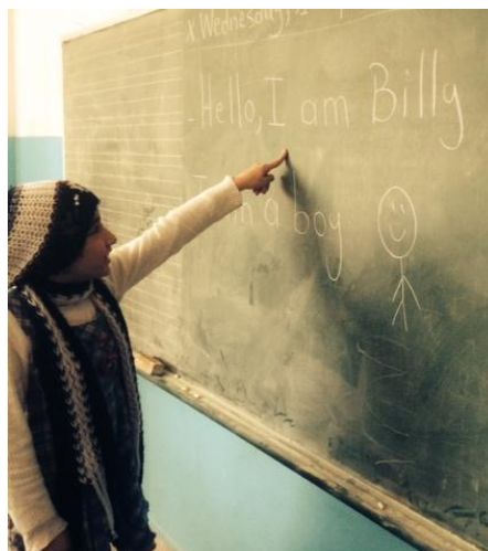
Refugee Child participating in education activities.