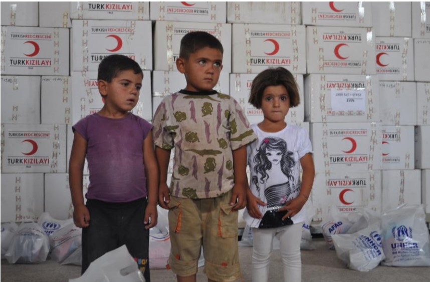
Stocks of core relief items for distribution in Gaziantep