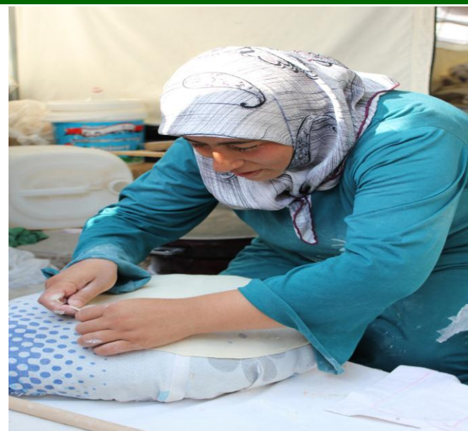
A Syrian woman making bread- Kahramanmaraş camp

In May, direct transfers to beneficiaries' e-Food cards in refugee camps amounted to about US$ 6.7 million.