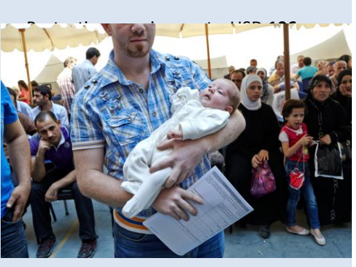
Syrian refugees await registration at the UNHCR registration site.