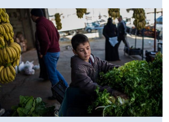
Syrian Refugees boy, sorts vegetables at a groceries store in Bebnine, Akkar