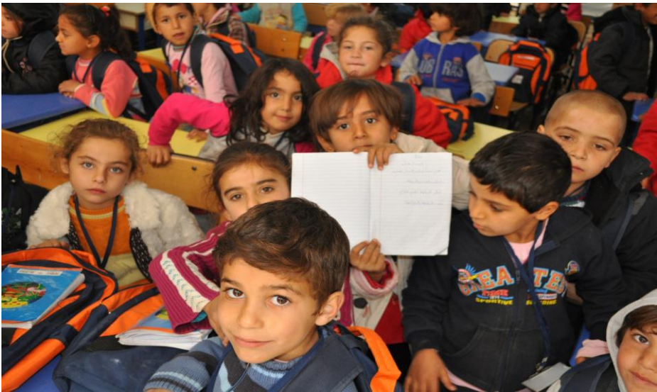
Syrian students attending class in Adiyaman refugee camp

Participating Agencies: UNICEF, UNHCR, IOM