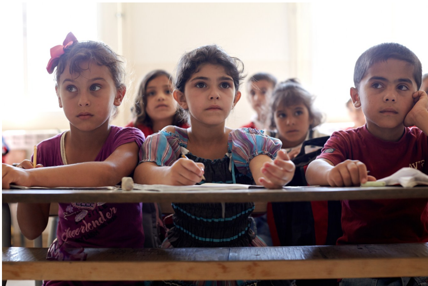
Syrian refugee children attending an accelerated learning programme in Bekaa.

The 2013/14 school year concluded and students are now on summer holidays. This school year completed the pilot of second shifts in public schools, which expanded access to formal education for refugees. As outlined in the government’s education proposal, “Reaching All Children with Education (RACE) in Lebanon,” RACE Lebanon, which was officially endorsed by the Minister of Education in June, the government is committed to education of on average 413,000 Syrian refugee and vulnerable Lebanese children each year through both formal public schools, and non-formal education programs. There are plans for summer programs which have been put on hold awaiting final approval process of MEHE. These programs are targeting out of school children or those at risk of dropping out/falling behind to prepare them for the upcoming school year starting in October. Some non-formal education programs are still continuing outside of schools in the summer months to help prepare out of school children to transition into formal education.