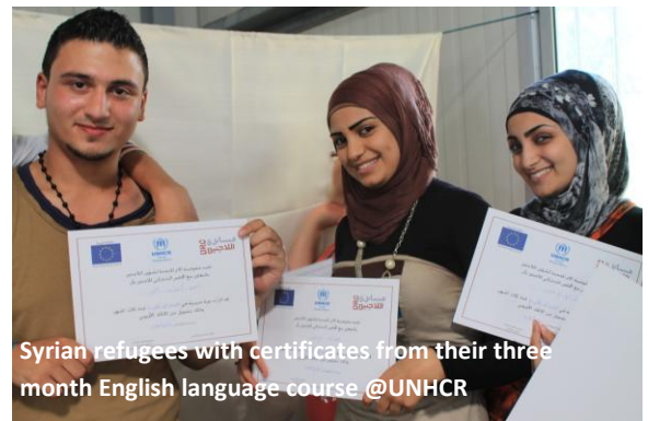
Syrian refugees with certificates from their three month English language course

Persons living with disabilities have low self-esteem, feel unproductive and are finding it difficult to integrate in their communities. Older persons expressed feelings of isolation, neglect and of being a burden on their families. With a dispersed Syrian population and limited capacities, UNHCR is exploring innovative ways to reach out and timely identify needs, risks and priorities, as well as to engage and support refugees in offering solutions.