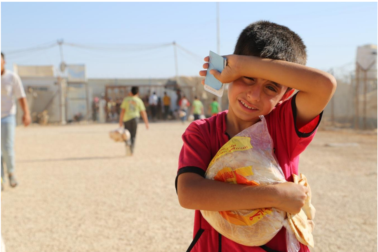
Food distributions in Zaatari Camp, Jordan.