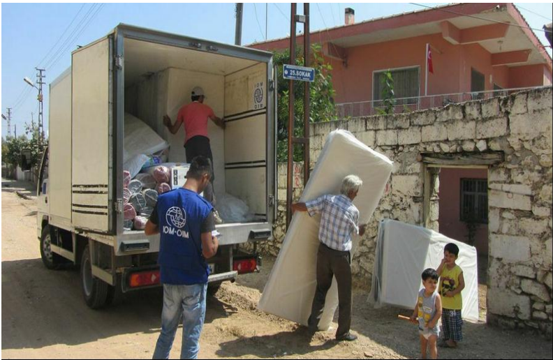
Provision of NFIs to Syrians in Hatay province

In August, IOM continued to distribute emergency non-food items in Hatay province assisting 590 families (2,821 persons). IOM's distributions target both new arrivals in areas where IOM is operational such as Kirikhan, Kumlu, Hassa and other villages in Hatay, as well as those previously assessed as requiring NFIs.