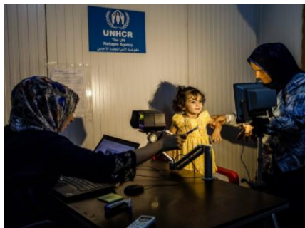
Iraq, KRI