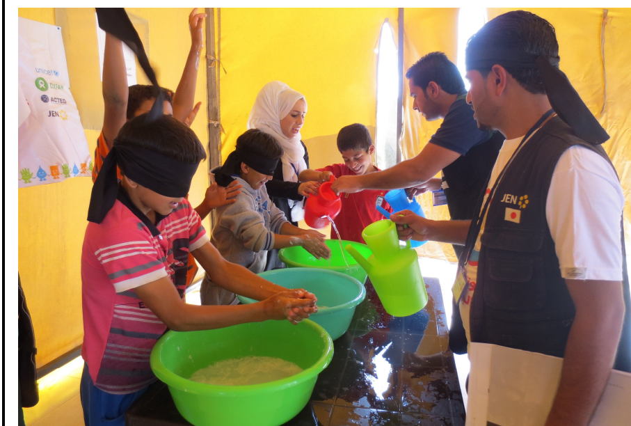
JEN staff facilitate activities with children on Global Handwashing Day (15 th October). Hands were marked with a germ-shaped stamp and children were tasked to remove the stamp as effectively as possible by washing their hands.