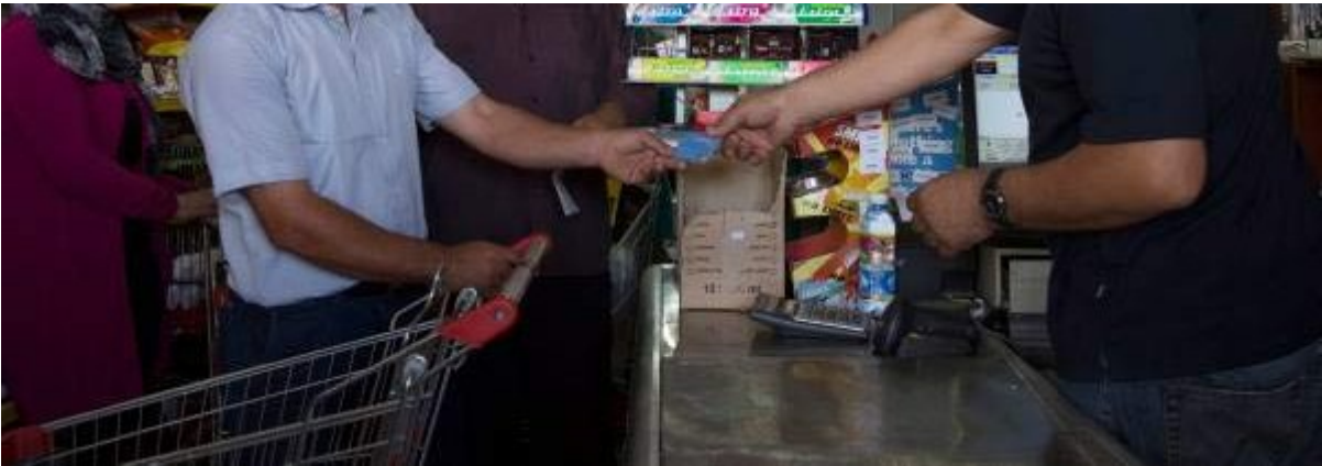
WFP e-card programme reaches some 855,570 Syrian refugees

The FAO, in partnership with REACH, initiated a country-wide food security and livelihood assessment. This assessment is mainly focused on host communities but will include some refugees residing in the host communities as well. There were no changes to the number of livestock reached during the joint FAO/Ministry of Agriculture national livestock vaccination programme.