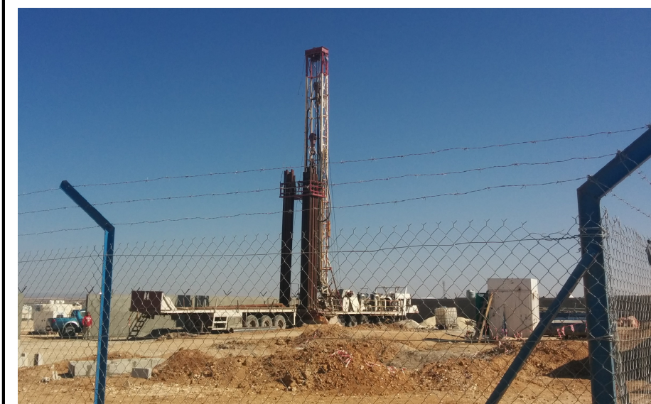
Drilling of borehole number 3 in district 7 by Mercy Corps and UNICEF.