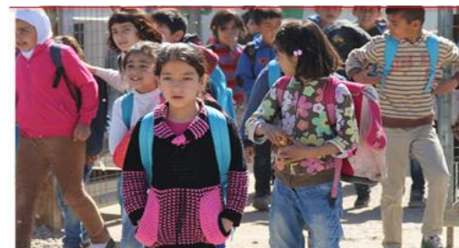
After school day in Kawergosk refugee camp, Erbil.

In Egypt, five field visits were conducted to Syrian community schools as part of the sector monitoring plan. 3RP partners identified 38 cases of Syrian children with learning difficulties and facilitated remedial learning and the necessary medical assistance. A further 21 cases of children with disabilities will receive direct assistance including wheel chairs, hearing aids, and eye glasses. A five days screening for nearly 700 Syrian children with learning difficulties also took place in two schools district.