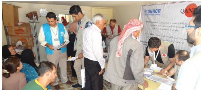
MPCA Bank checks distribution for Syrian Refugees – Erbil, April 2016

Multi-Purpose Cash Assistance (MPCA) is growing in importance in Iraq and is rapidly becoming an integral part of the humanitarian response. Where markets are functioning, accessible to beneficiaries and transfer modalities exist, unconditional cash assistance provides the opportunity to meet the needs of people affected by crisis in an effective and efficient way.