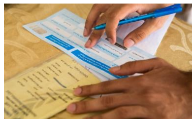
WFP paper food vouchers, Photo/ WFP