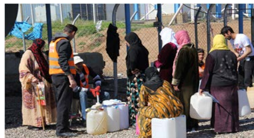
Extra kerosene distribution for vulnerable families in Darashakran refugee camp, Erbil, Kurdistan Region of Iraq.

Basic needs assistance is provided to eligible families across the region, through ongoing socio-economic assessment, using identification and selection criteria that combine protection, social and economic criteria, to indicate severe vulnerability and required interventions through provision of cash grants to meet their basic needs, and CRIs such as blankets, mattresses, plastic sheeting, jerry cans and kitchen sets.