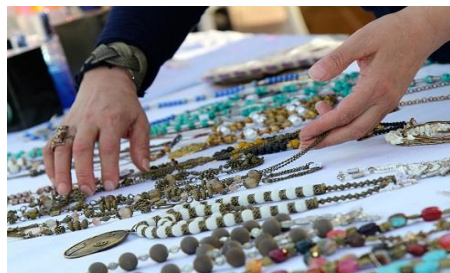
Syrian entrepreneurs showing their products at UN day's open bazar,