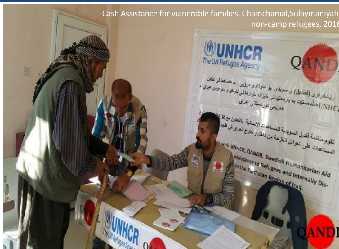
Cash Assistance for vulnerable families. Chamchamal, Sulaymaniyah, non-camp refugees, 2016