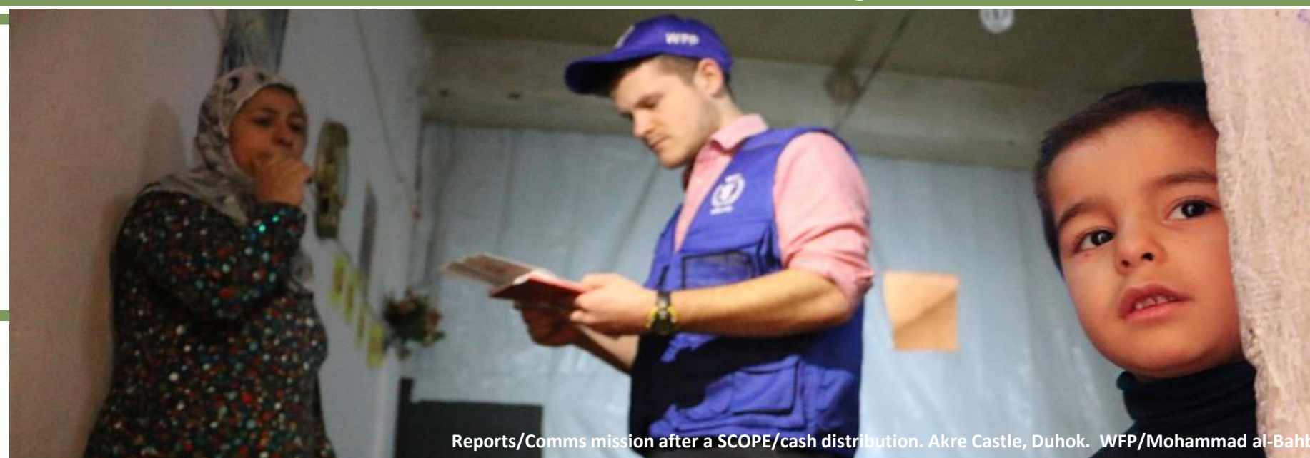
Reports/Comms mission after a SCOPE/cash distribution. Akre Castle, Duhok.

In collaboration with UNHCR, WFP is cleaning up beneficiary lists. This includes adjusting family sizes, and removing the families who are not residing in refugee camps anymore or who have not collected their