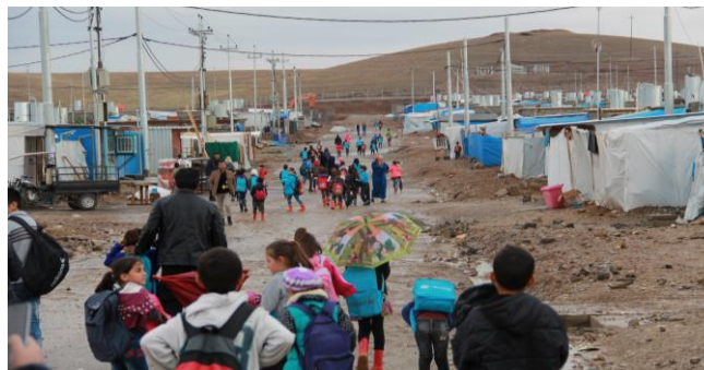
Darashakran camp, Erbil O. Zhdanov

Duhok: Rehabilitation of 9 refugee schools (provision of 25 prefabs to 12 choos in host communities reaching 10,996 students and 360 teachers. A distribution of cash for uniform assistance was given reaching a total of 8,796 students. 10 Teacher Learning Circles (TLC) was attended by 104 teachers. All 14 Parent-Teacher Associations received training SIPs. Transportation students have helped increase access to learning; including 144 trips to transport 121 kids from Domiz 2 camp, and Domiz community to attend schools in Domiz 1 camp, and 24 trips to transport 17 kids from Akre camp to attend school in Akre town.