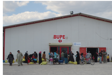
Syrians supported by WFP and TRC's e-food card programme shopping in the camp markets.

The Vulnerability Sub-Working Group and Cash-Based Interventions Technical Working Groups have discussed the Draft Terms of Reference at Gaziantep level and will proceed to presenting the ToRs to inter-agency counterparts at the Syria Task Force during the first week of February.