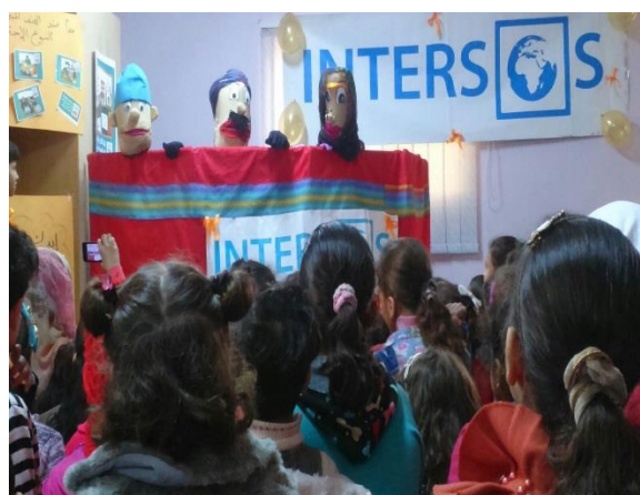
INTERSOS Puppet show

ARDD-Legal Aid's lawyer created a radio episode about domestic violence, laws and legislations underlying challenges and protection mechanisms. Also, ARDD-Legal Aid's Psychosocial Support Specialist spoke in Amman about the psycho-social aspects related to Early Marriage. In Jerash , UNHCR & Terre des Hommes (TDH) hosted Lawyers from ARDD-Legal Aid spoke about the legal aspects of SGBV touching on the penal code and the various types of violence against women which are criminalized by law. They also spoke about the status of women in Jordanian law.