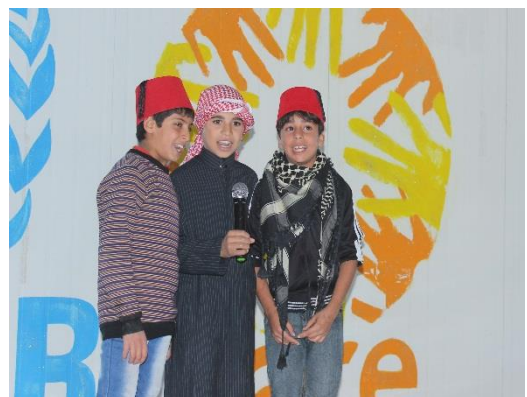
CARE/ UNHCR: Awareness Session

Over 150 SGBV case managers and community mobilizers were trained by UNHCR on the discussion tool developed for the campaign. Over 31 group discussions on gender equality and SGBV prevention and response were facilitated by SGBV SWG members with more than 3,500 men and boys in schools, community and recreational centres, in refugee camps and urban settings. Male staff from different organizations took the lead in the implementation of the activities of the campaign, marching and giving speeches against violence. These activities have notably impacted the engagement of men and boys in SGBV prevention and response, encouraging the continuation of the initiative during 2016.