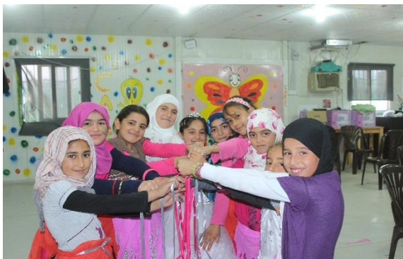
IMC-UNHCR Awareness Session

A opening event organized by Jordanian National Commission for Women (JNCW) with the support of UN Women to announce the beginning of the 16 Days campaign and present the calendar of activities for 2015, which was attended by UN Senior officials, NGOs, members of Shams' network and the media.