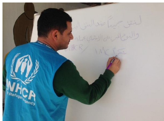
Azraq Camp: UNHCR Awareness session

UNHCR and IMC organized a marathon for all members of the community against violence and hosted an event where Syrian refugees played traditional songs, participated in an interactive theatre, and screened a huge canvas for the community to express their feelings of safety from SGBV. Family photographs were also available for participants and pens were distributed with "عائلتي أمني" written on