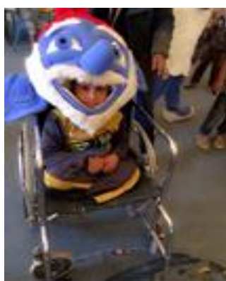
Mercy Corps: Clown Performance

During the campaign IMC, NHF –IFH, FPCS, UN Women, UNICEF, UNHCR, Save the Children – Jordan, IOM, and Medecins du Monde, implemented other activities that included a theatre for people with disabilities, a drawing session, walking marathon, a play depicting different types of violence and awareness sessions.