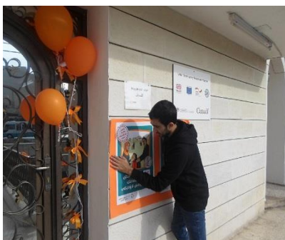
Entrance of CARE International Center. Male staff campaigning against SGBV

The materials were disseminated to the communities through 30 different organizations working in all governorates across the country and were posted in a number of locations, including registration sites, help desks, clinics, women's & girl's safe spaces, child friendly spaces and schools, both inside and outside refugee camps.