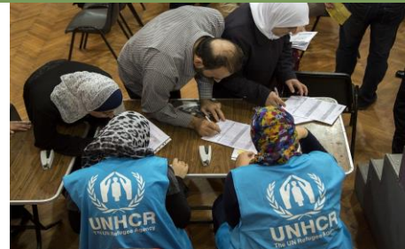
Verification Exercise- Cairo.