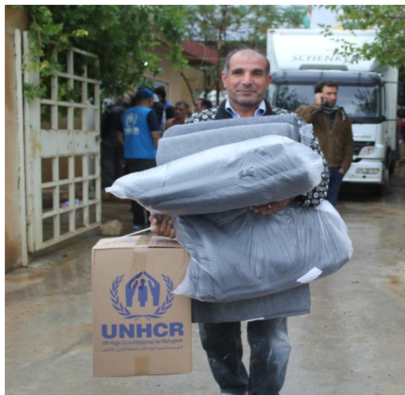
Winter assistance, Shawes Neighborhood, Erbil.

Anbar/Al-Qaim: A strong dust storm hit the camp on earlier of Oct led to collapsed and damage in 185 tents, Last 6 family tents (in camp stock) replaced the damaged tents and 35 canvas tents to families who lost their tents, 76 families moved to the kitchens as temporary solution. 11,900 liters of kerosene was distributed by UNHCR through ISHO during the month of October 2015. The number of families benefiting from this activity was 183 families.