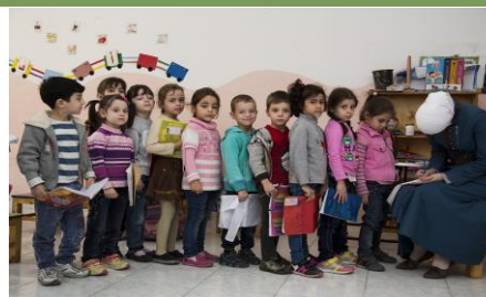
Syrian refugee children take part in classes at the private community school, 6th of October, Cairo, Egypt.