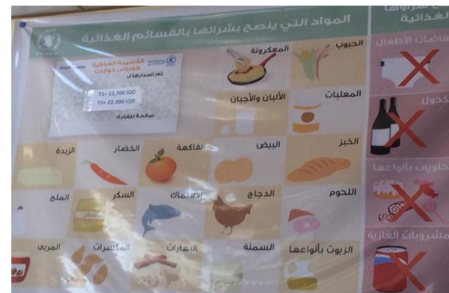
Voucher redemption, Domiz2 camp, Duhok

* Tiered approach continued in September 2015: 787 individuals received US $19 paid in Iraqi dinars 43,225 individuals received US$10 paid in Iraqi dinars