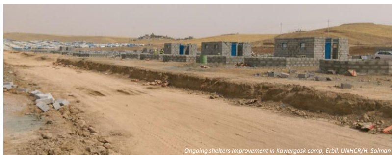
Ongoing shelters Improvement in Kawergosk camp, Erbil.

Sulaymaniyah: an assessment has been conducted by UNHCR and Qandil to renovate 50 houses including electrical, plumbing and WASH works. These houses were selected according to UNHCR vulnerability criteria. Qandil started the renovation works and will be completed in October 2015.